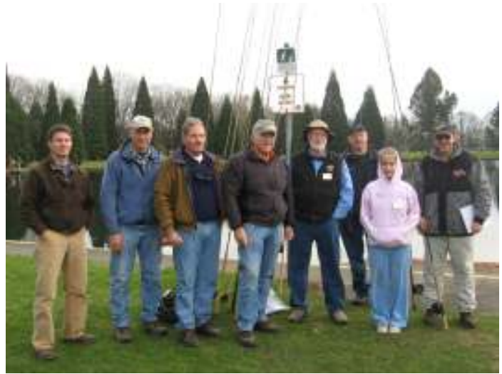
Westmoreland Casting Pond Crew

Pictured are a few members attending the November NSSC meeting. Thanks to Roman Koran for the great pictures. Check out the web page and click on Picture Gallery then Westmoreland to see a small slide show of the meeting.